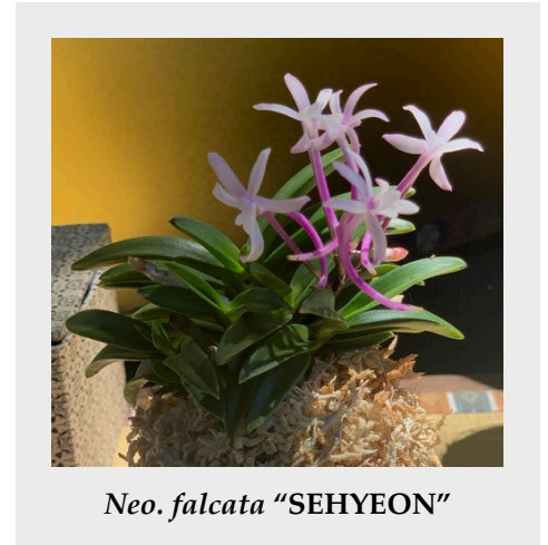
Neo. falcata "SEHYEON"