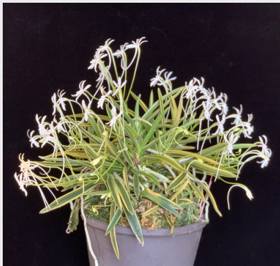
Neo. falcata "GOJOGUKURIN"